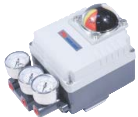
With Dome Indicator

Note : 1) 1/2 split range is available for 3-9 psi input signal or 9-15 psi input signal 2) Please contact for 6-30 psi input signal 3) Operating angle can be adjusted to 0~60° or 0~100°